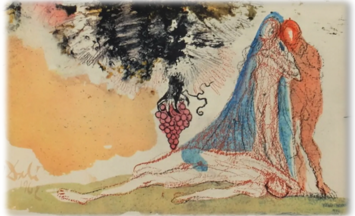
Details from The First Vine by Salvador Dali